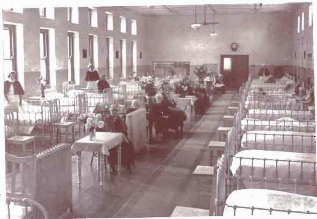
THE STANLEY ARGYLE WARD.