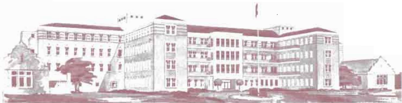
AN ARTIST'S DRAWING OF THE NEW BUILDING NOW BEING ERECTED.