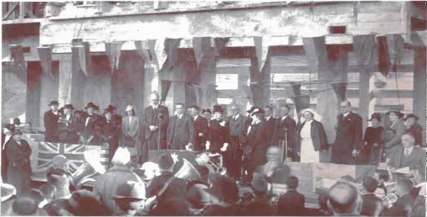
THE OFFICIAL GROUP AT THE LAYING OF THE FOUNDATION STONE.