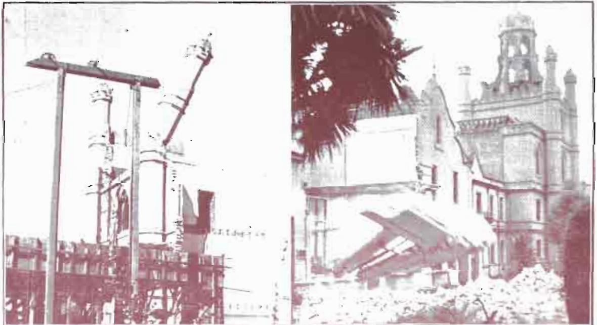
PHOTOGRAPH TAKEN DURING DEMOLITION OF THE OLD BUILDING.