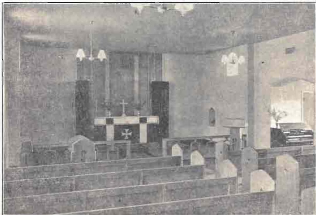
The Chapel where services for each denomination are regularly held.