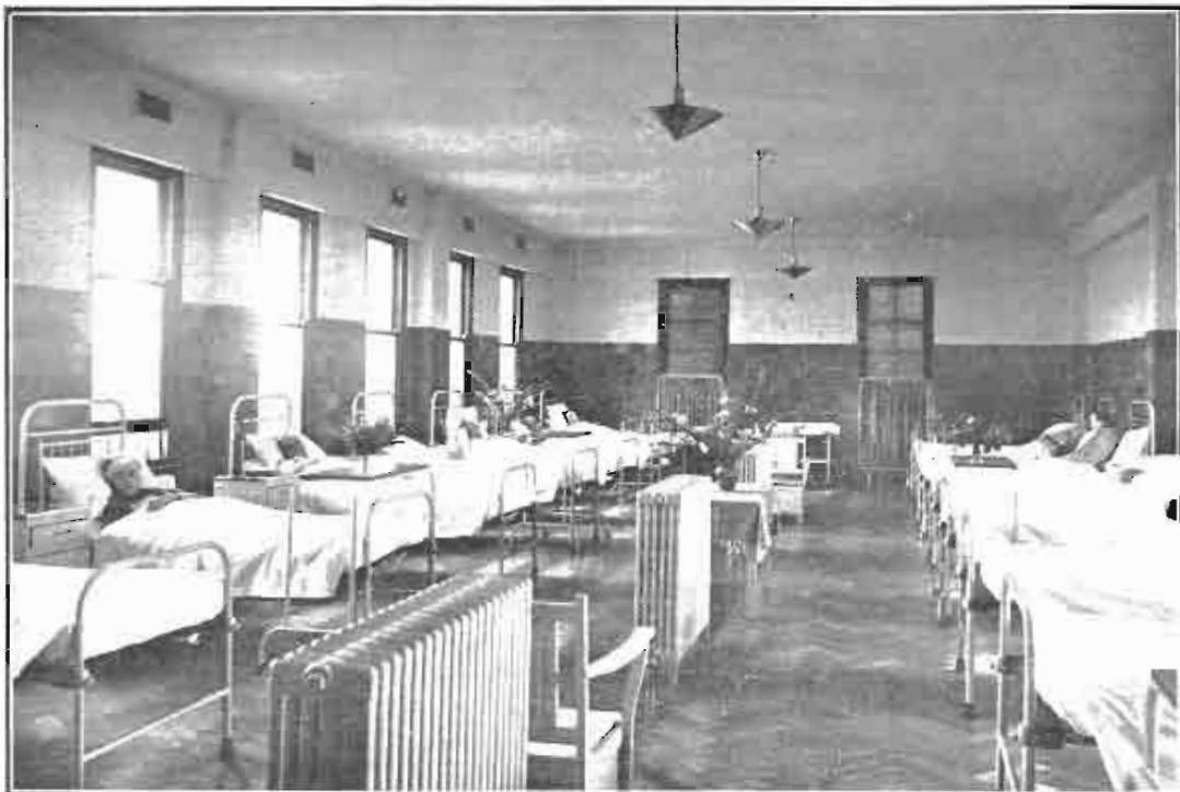
One of the Sixteen 18-bed Wards for Patients.