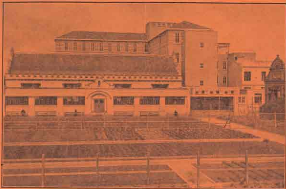
Portion of Vegetable Garden, north of the Edward Wilson Ward.