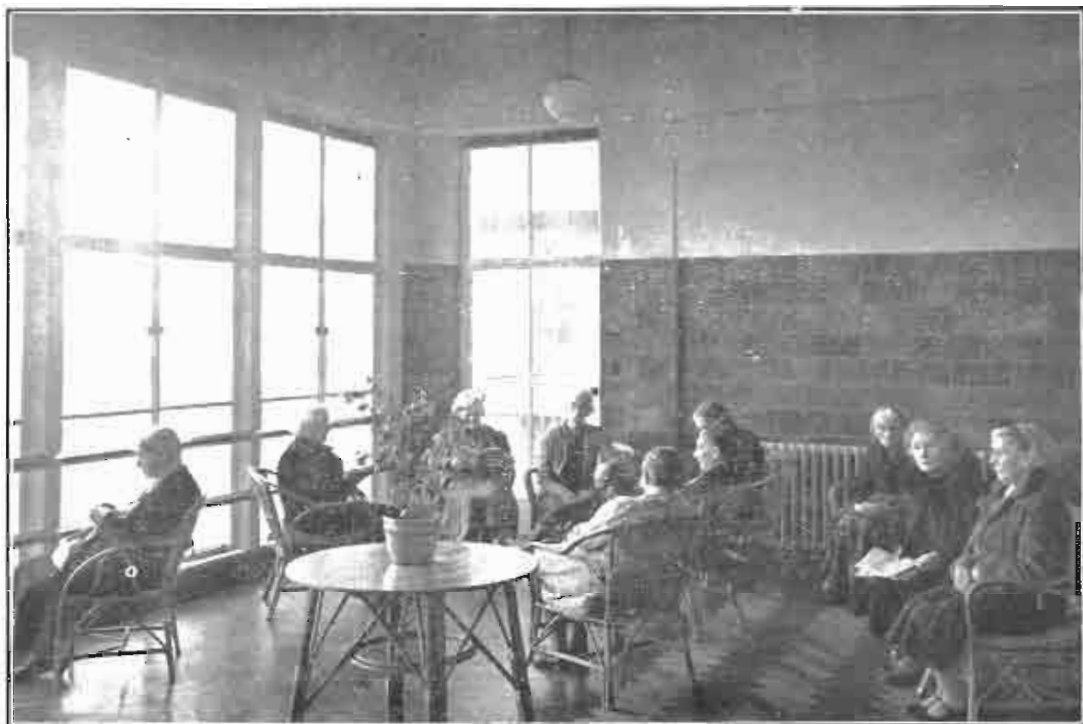
A pleasant Lounge Room with Easterly aspect for Convalescents, who enjoy a panoramic view of the City. One of these Sun Rooms is situated on each of the first, second and third floors.