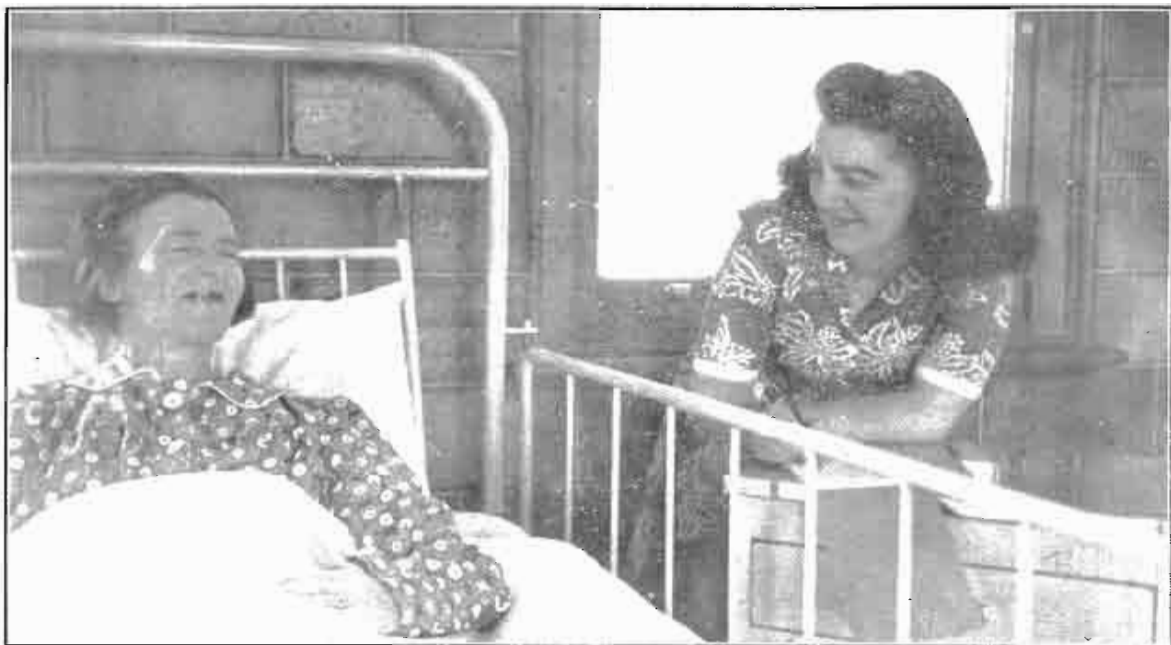
Taking down reply to a letter received by an incapacitated inmate.