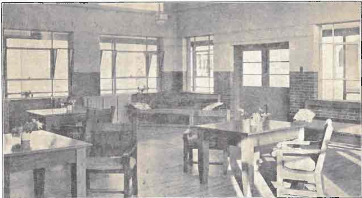
Women's Lounge Room.