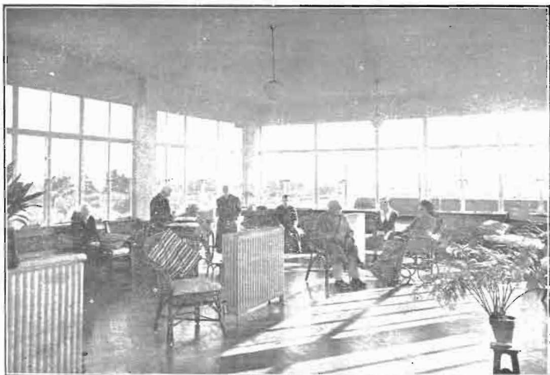
The Southern Solarium, where patients spend many pleasant hours. There is also a Solarium of equal size at the northern end of the building.