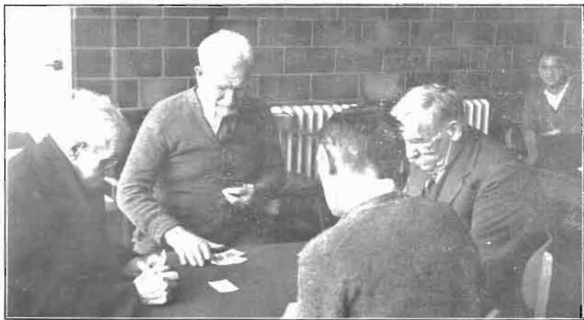
A quiet game of cards in the Men's Sun Room.