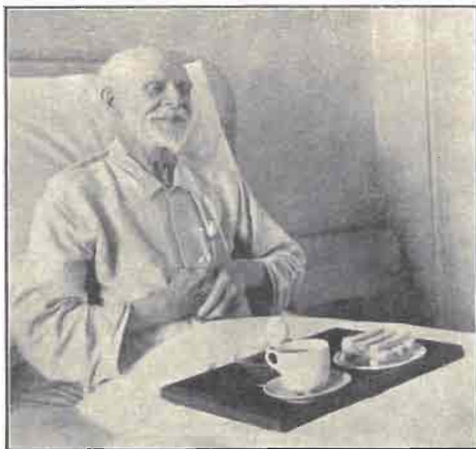
One of our inmates enjoying an egg sent in through the Schools' Egg Drive.

N.B.—An Obituary List of Life Governors is filed at the Institution, and the Secretary will be obliged if notification is given to him of the names of deceased included in the above list.