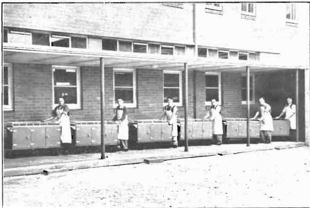
The six electrically heated Food Trolleys on the way to the lifts. Each Trolley carries sufficient food for 60 bed-patients.