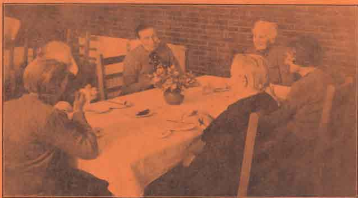
Inmates at Tea.