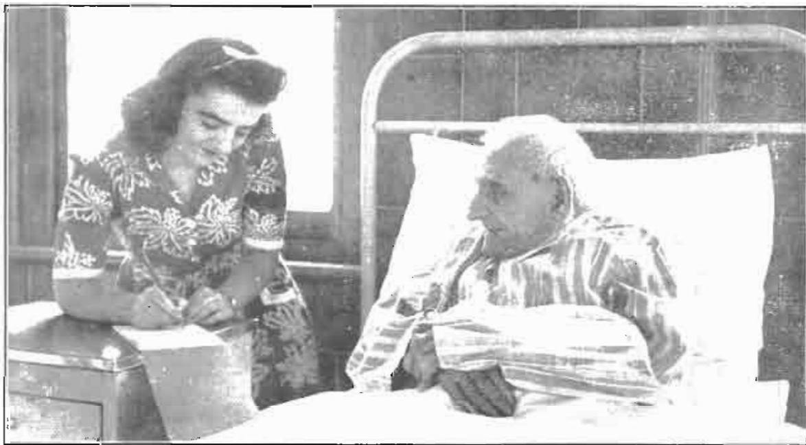
This letter service is greatly appreciated by relatives and friends of our Blind and incapacitated inmates.