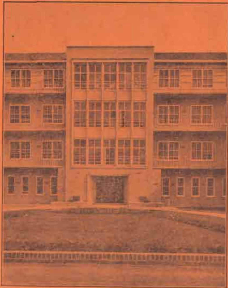
Front Entrance, showing Sun Rooms on first, second and third floors.