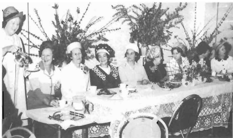
Spring Tea — 1970

Life Membership Fee — Two pounds and two shillings