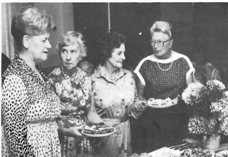
March Tea — 1983

Opportunity Shop financial returns enabled the Auxiliary to purchase substantial items of equipment the Hospital needed.