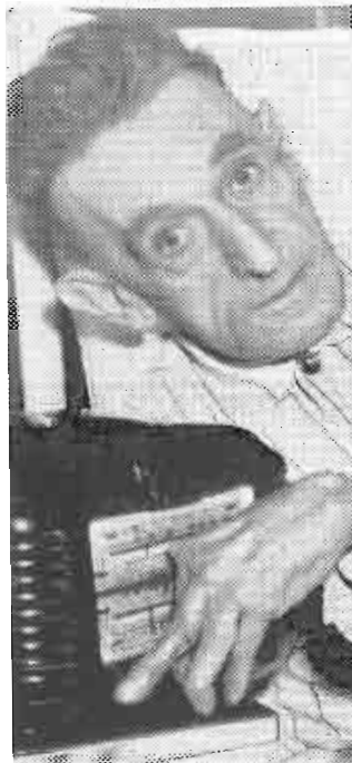
RADIO IS A COMFORT AND ENTERTAINMENT.

It will be appreciated that in a large Institution such as the Queen Elizabeth Benevolent Home, the matter of staffing is one which calls for careful consideration and selection. The Home is literally a self-contained community in itself, requiring Administrative, Catering, Dispensing, Maintenance, Laundering, Sewing, Stores, and Domestic Departments, as well as the direct medical and nursing care which necessarily comes into most prominence.