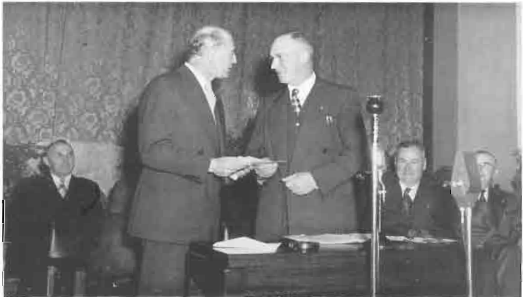
THE HON. THE MINISTER FOR SOCIAL SERVICES, Mr. WILLIAM McMAHON, M.H.R., HANDING THE ACTING-PRESIDENT A CHEQUE FOR £15,000, BEING THE FIRST PAYMENT OF THE COMMONWEALTH GRANT TOWARDS THE NEW WING.

Your Board will now proceed with the erection of the Ground and First Floors of the proposed new wing. It was confidently expected that the State Government, through the Hospitals and Charities Commission, would contribute sufficient funds to complete the four-storeyed building in one contract. Up till the present the Hospitals and Charities Commission, while expressing general approval of the scheme, is unable to promise that funds will be available within the next three financial years.