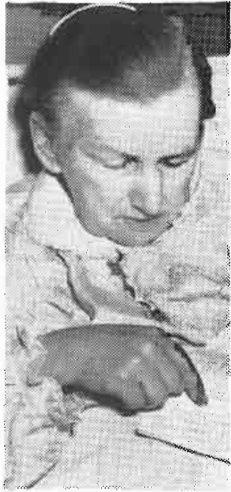
READING PLEASANTLY PASSES MANY AN HOUR.

The present position is that it has become more and more necessary to provide suitable accommodation for the aged and infirm in our midst.