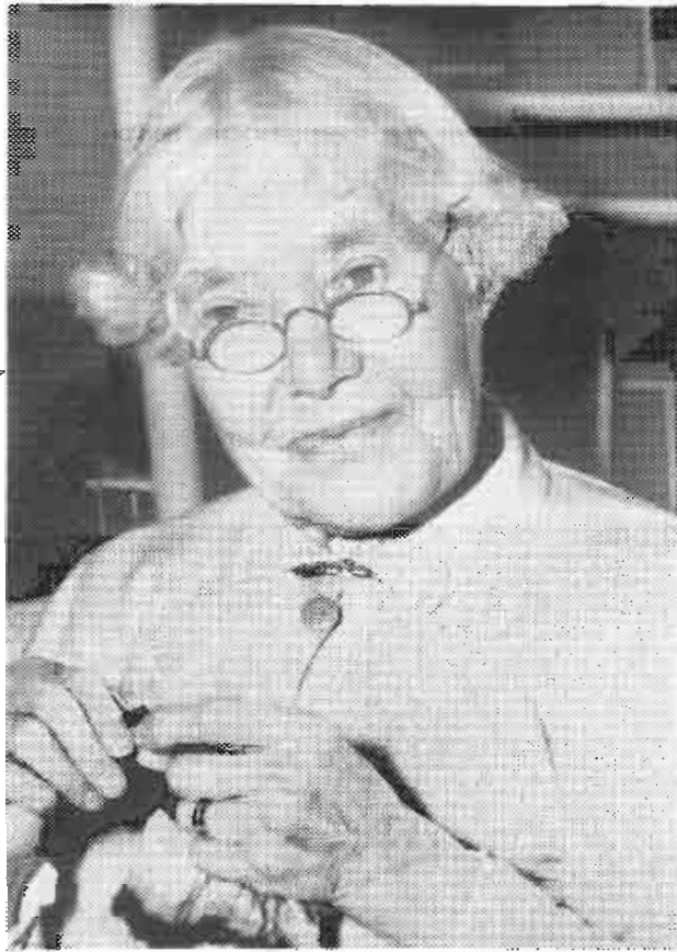
A NONAGENARIAN KNITTING TEA COSY.