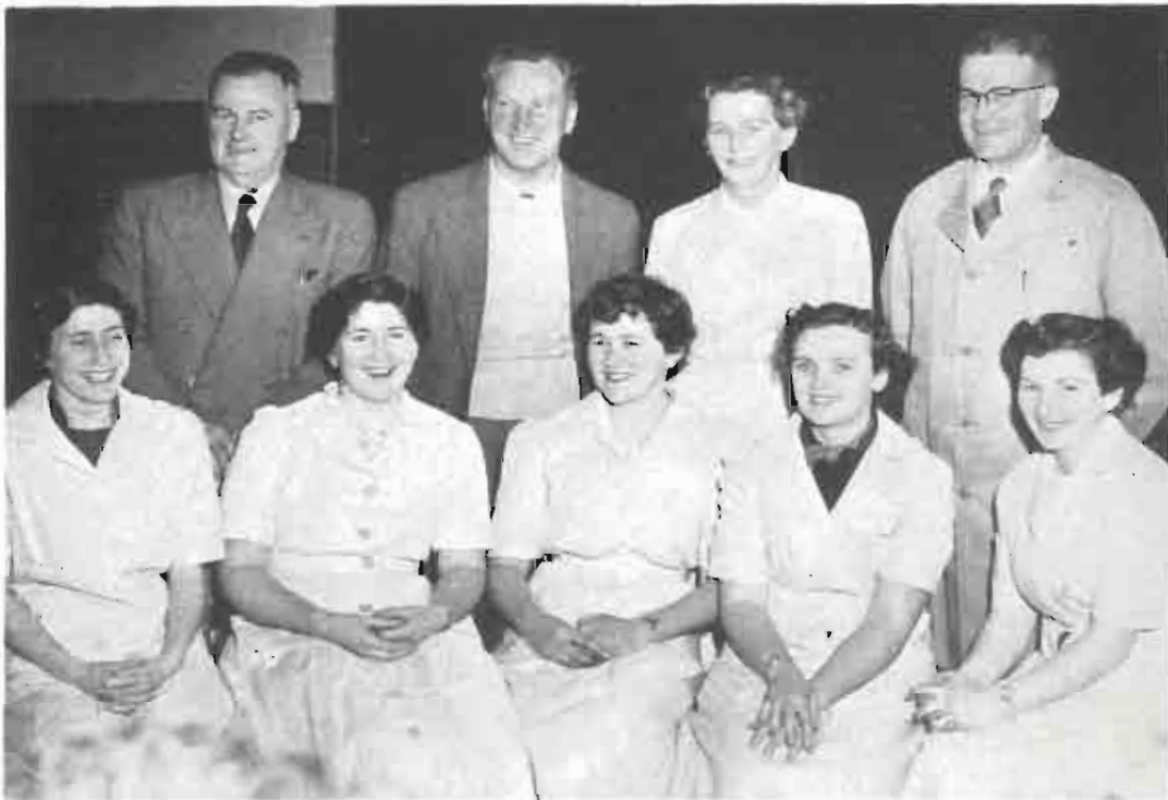
INSTITUTIONAL MANAGEMENT DIPLOMA STUDENTS OF GORDON INSTITUTE OF TECHNOLOGY, GEELONG, SPENT A FORTNIGHT AT THE QUEEN ELIZABETH HOME GAINING PRACTICAL EXPERIENCE. IN THE GROUP ARE THE PRESIDENT, MANAGER, CATERER AND DOMESTIC SUPERVISOR.