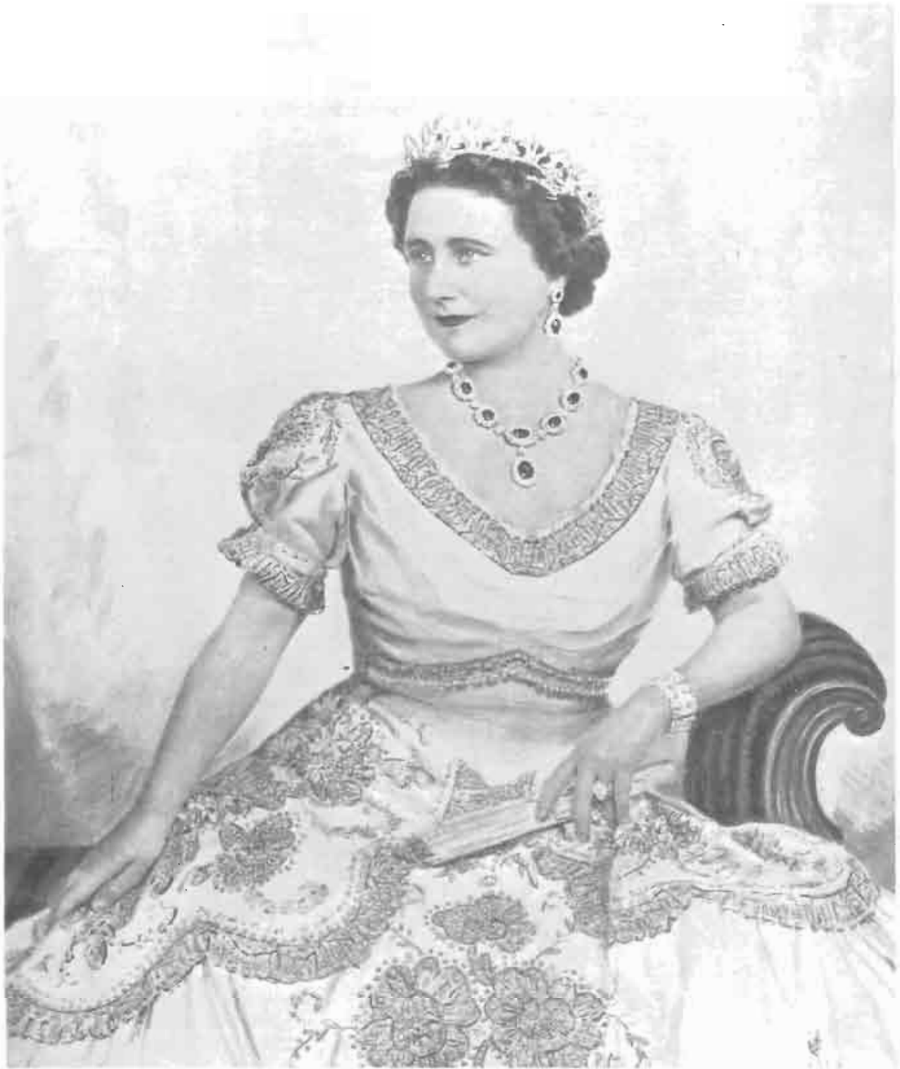
THE QUEEN MOTHER, QUEEN ELIZABETH. ROYAL ASSENT WAS GIVEN IN 1946 TO THE NAMING OF THIS HOME: "THE QUEEN ELIZABETH BENEVOLENT HOME."