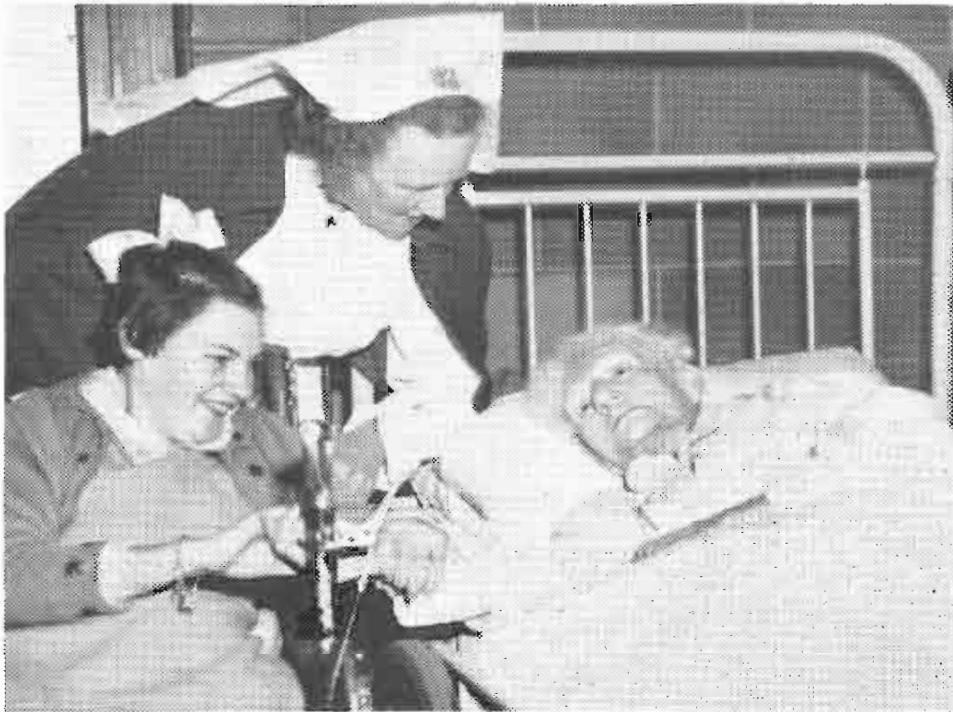
MATRON WITH THE OLDEST AND YOUNGEST INMATES.

Again normal expectation of life has been extended by the discovery of "wonder" drugs in recent years. These drugs may well intensify the problem in future years, when many who are still young to-day will be kept alive, possibly on the border line of health, to call for community care, but I leave that to the future