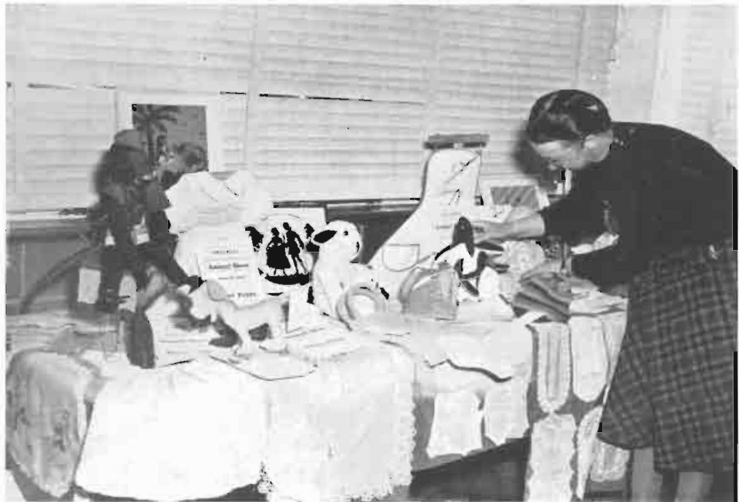
ARTICLES MADE BY INMATES FOR EXHIBITION IN BALLARAT SHOW.

EXTENSION OF SERVICES: Occupational Therapy. Your Board records its appreciation of the services of the Red Cross Handcrafts Instructors and, in order to provide better facilities for this important service, it is proposed to build an occupational therapy centre and library.