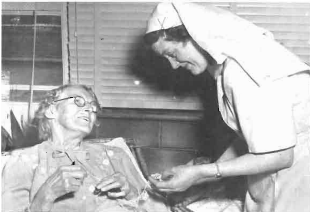
SISTER ADMIRES A PATIENT'S CROCHET.