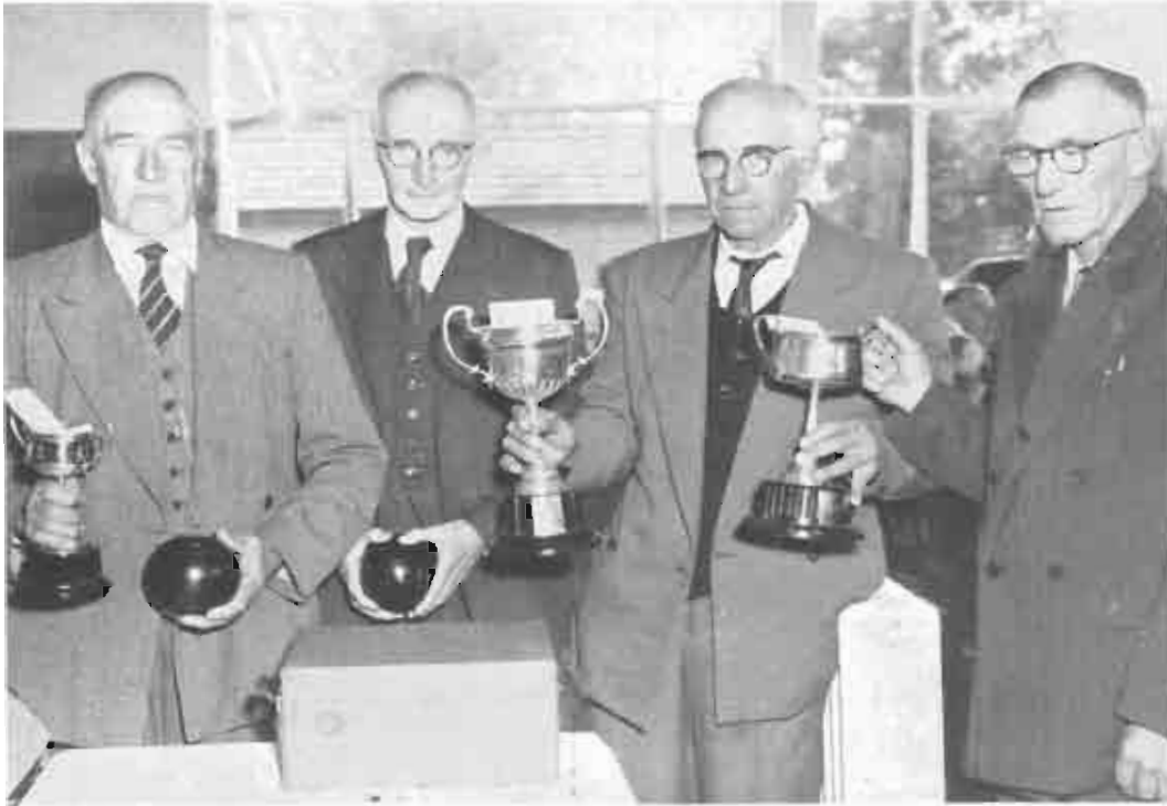
WINNERS IN BOWLING CLUB TOURNAMENTS WITH THEIR TROPHIES.