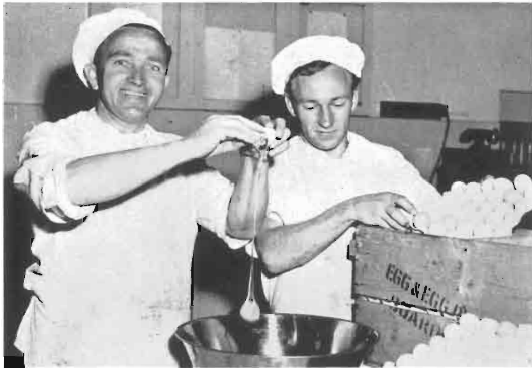
EGGS. THROUGH THE GENEROSITY OF THE SCHOOL CHILDREN OF BALLARAT AND DISTRICT IT IS POSSIBLE TO PROVIDE MANY HEALTHFUL AND APPETISING DISHES.