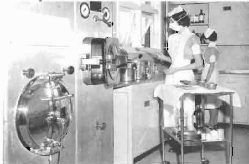
A view of a remodeled work room attached to the Medical Wards in the Queen Victoria Block.