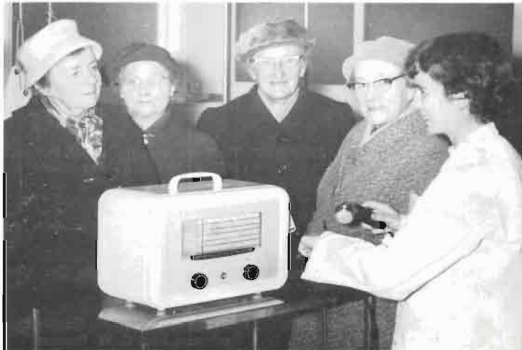
Members of the Sunshine Circle with the ultrasonic shortwave therapy unit that they donated to the Physiotherapy Department.