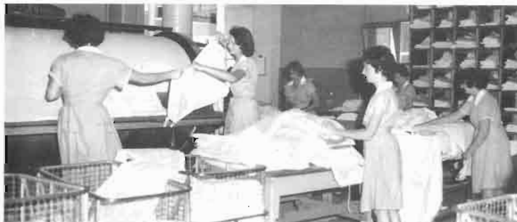
The Hospital's laundry processes approx. 800,000 lbs. of washing each year. It is a most important department.