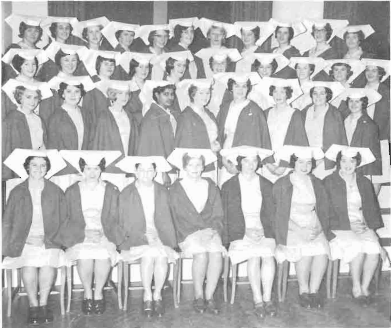
NURSES WHO RECEIVED THEIR CERTIFICATES AT THE GRADUATION CEREMONY ON 4th MAY.