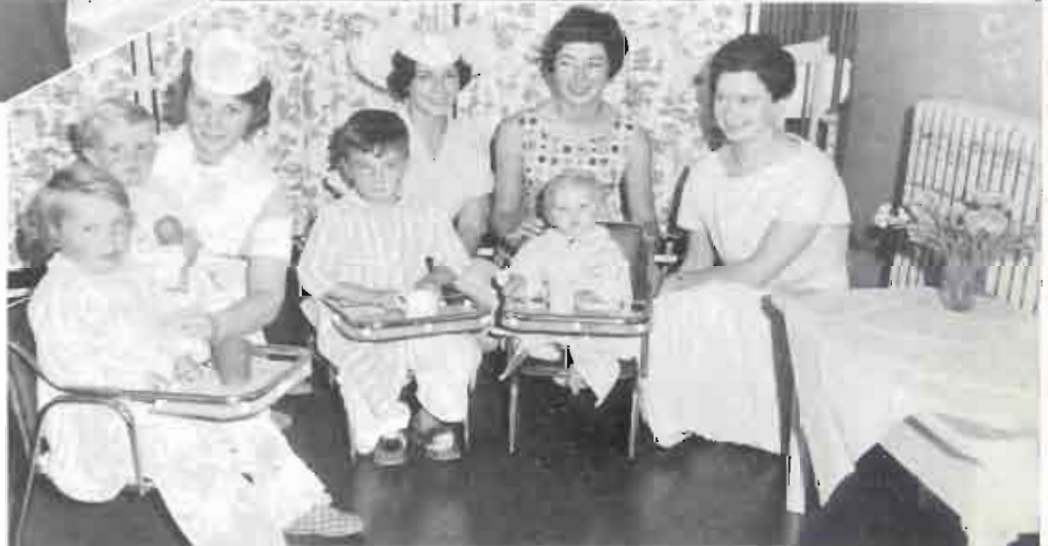
Right — Members of the Hospital Younger Set with the infant's chairs they donated to Ward 3.