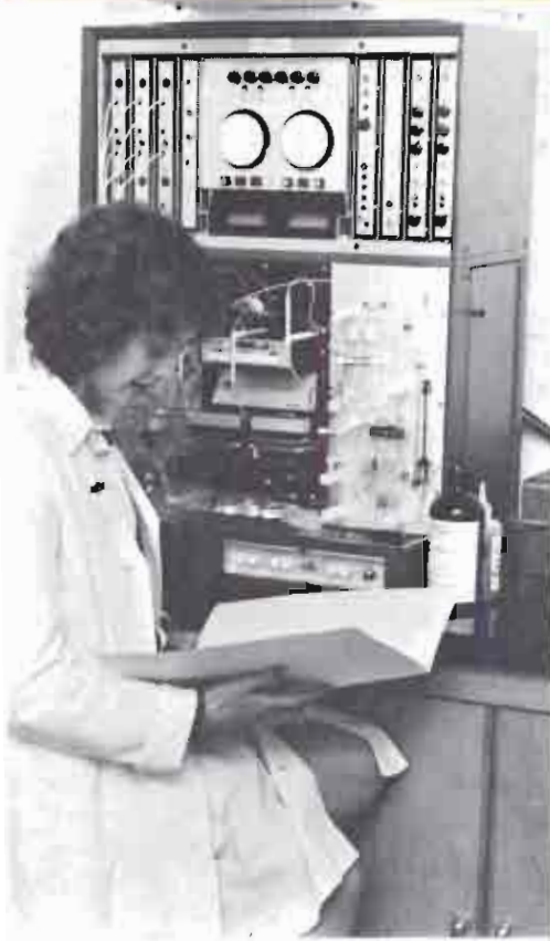
Installation of the Coulter Cell Counter at a cost of $38,950 enables full blood tests to be performed in 40 seconds compared with that previously of approx. 15 minutes, making it possible for more tests to be performed on each sample.