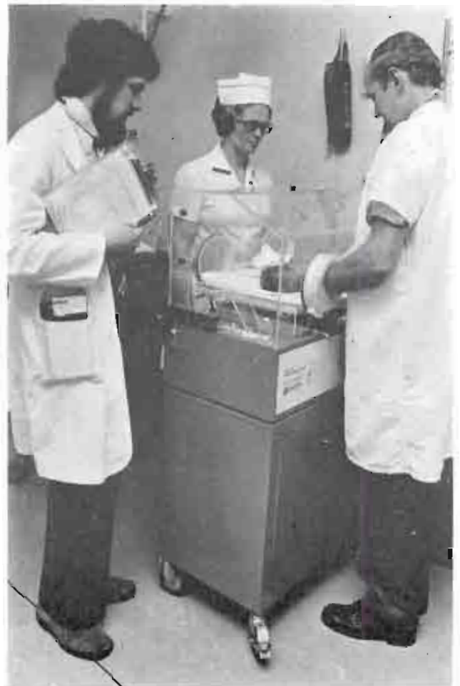
The care of premature babies is greatly facilitated with the use of the recently acquired additional Isolette Cot.