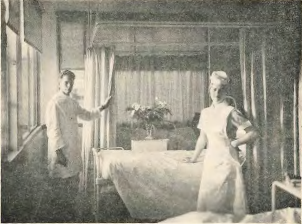
One of the wards showing new overhead type ward screens installed this year.