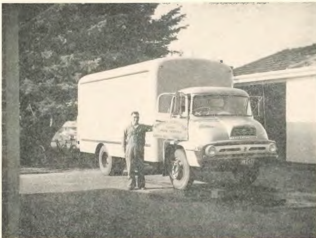
Laundry is delivered twice a week by this van from Wimmera Hospitals Group Linen Service — Most linen requirements for the Hospital are supplied by this Regional Service.