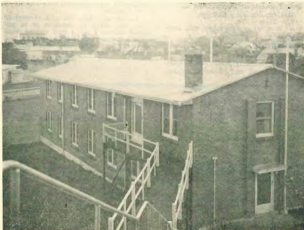
An unusual picture from the Hospital grounds showing the Sisters' Home in the foreground, and a section of the township in the background.