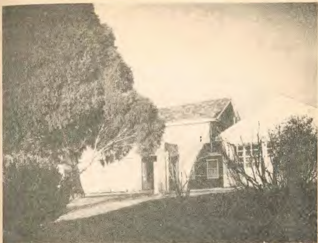
An unusual late afternoon study of the main entrance viewed from the grounds.