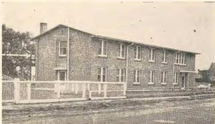
A view of the Sisters' Home