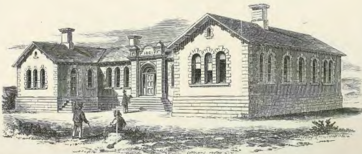
PLEASANT CREEK HOSPITAL