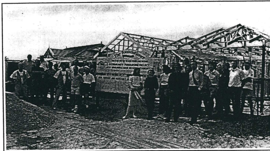
"Community Spirit building a strong Foundation"