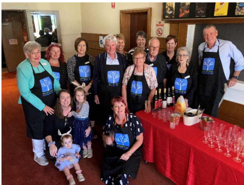
Hardworking volunteers enjoying a movie night