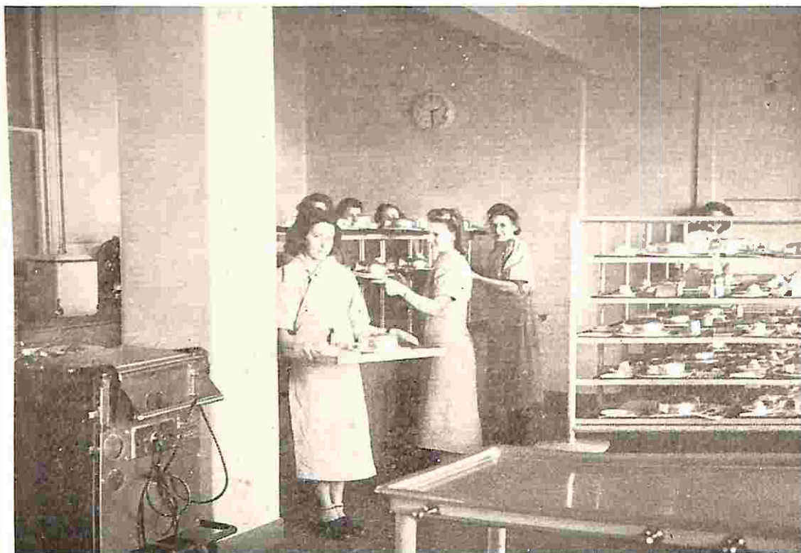
During the year 192,432 meals were served from this Kitchen.