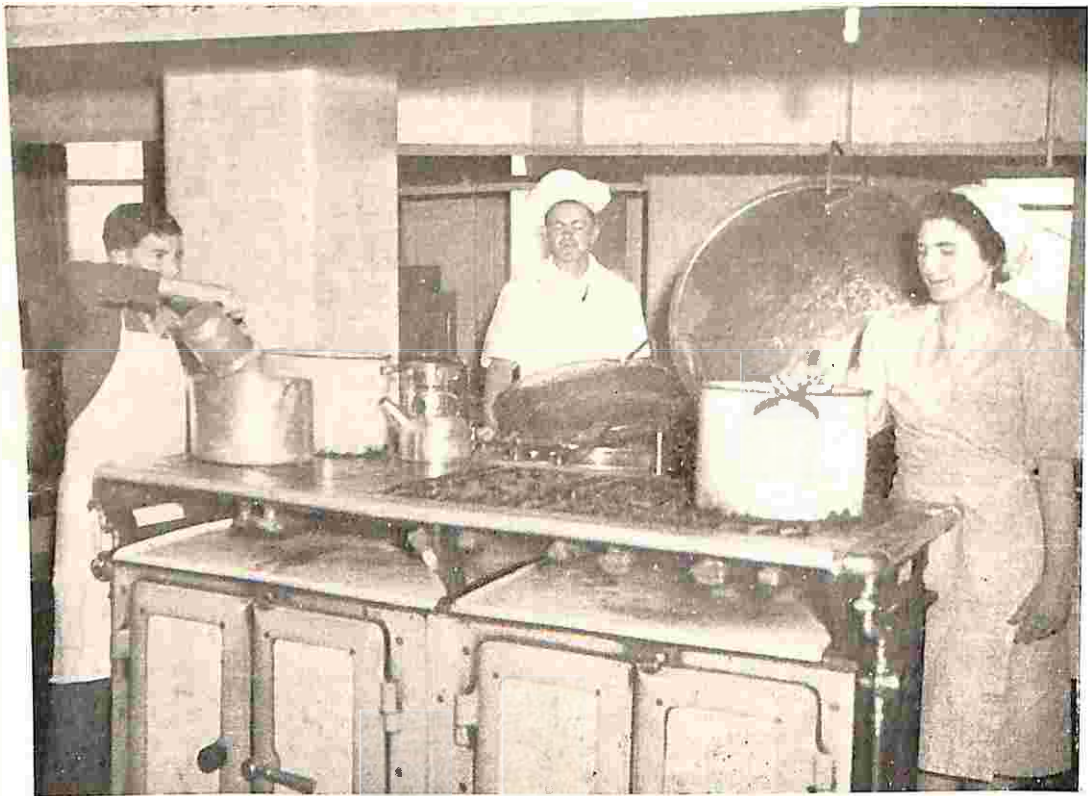
During the year 1924, 32 meals were served from this Kitchen.