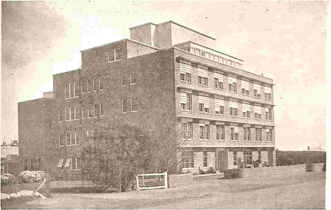
NEW BUILDINGS — First Section Completed.