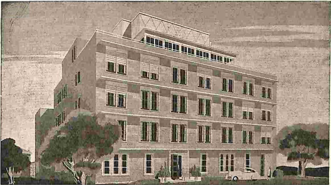
WIMMERA BASE HOSPITAL Semi-Private and Intermediate Block Baillie Street, Horsham