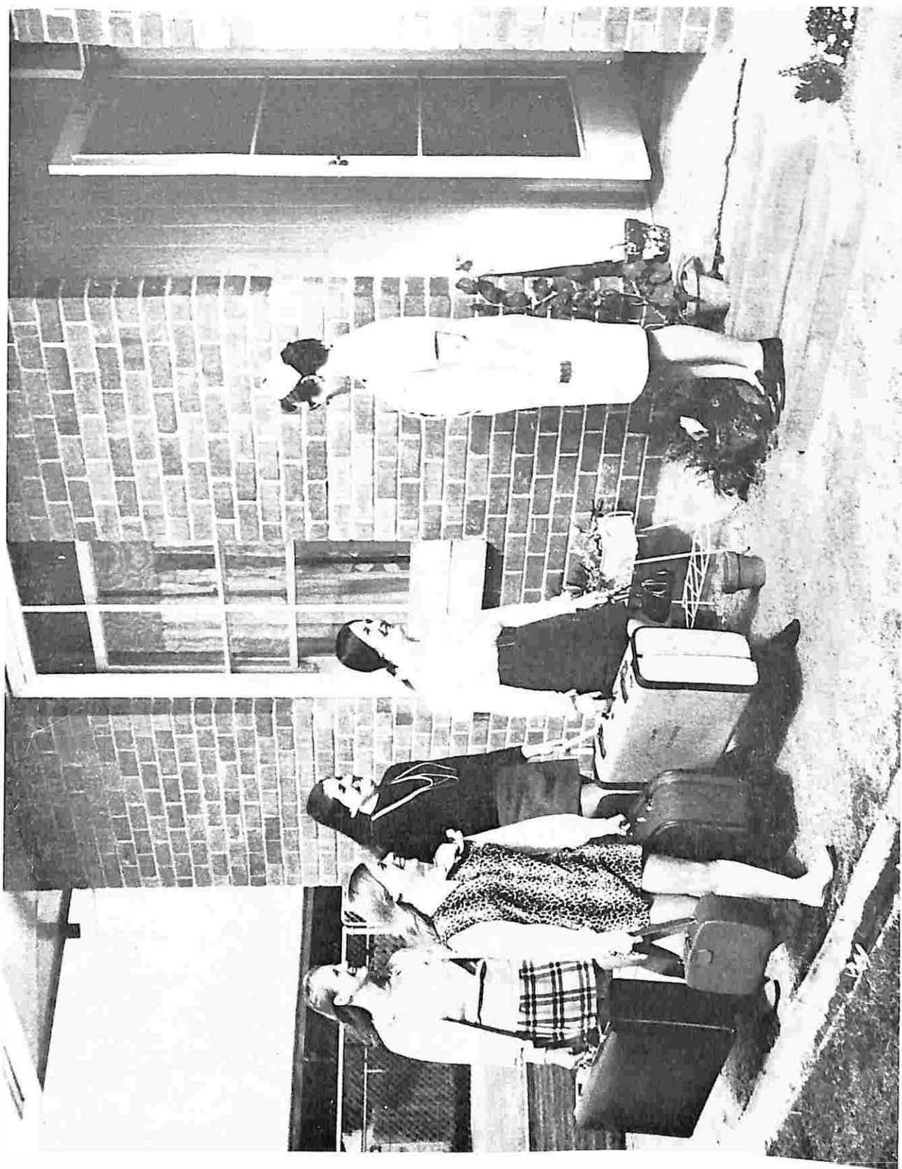
ARRIVING TO COMMENCE THREE-YEAR TRAINING PROGRAMME