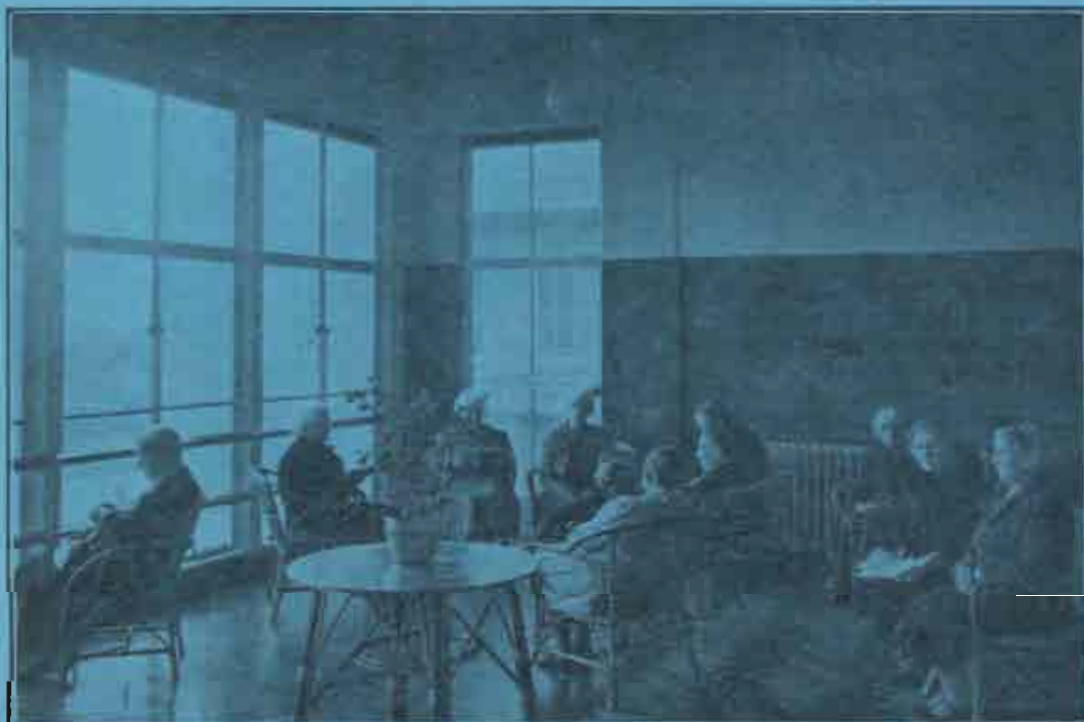
A PLEASANT LOUNGE ROOM WITH EASTERLY ASPECT FOR CONVALESCENTS WHO ENJOY A PANORAMIC VIEW OF THE CITY. ONE OF THESE SUN ROOMS IS SITUATED ON EACH OF THE FIRST, SECOND AND THIRD FLOORS.