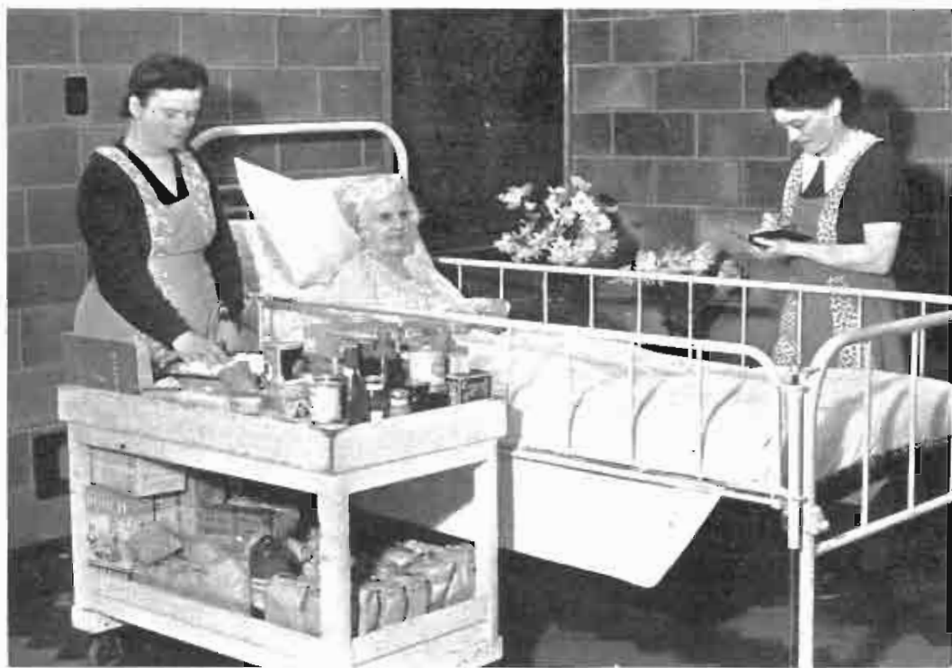
KIOSK ATTENDANTS TAKING ORDERS FROM BED PATIENTS.