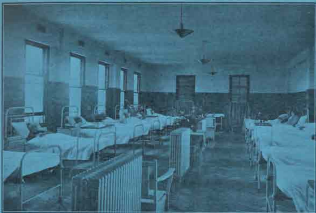
ONE OF THE SIXTEEN 16-BED WARDS FOR PATIENTS.