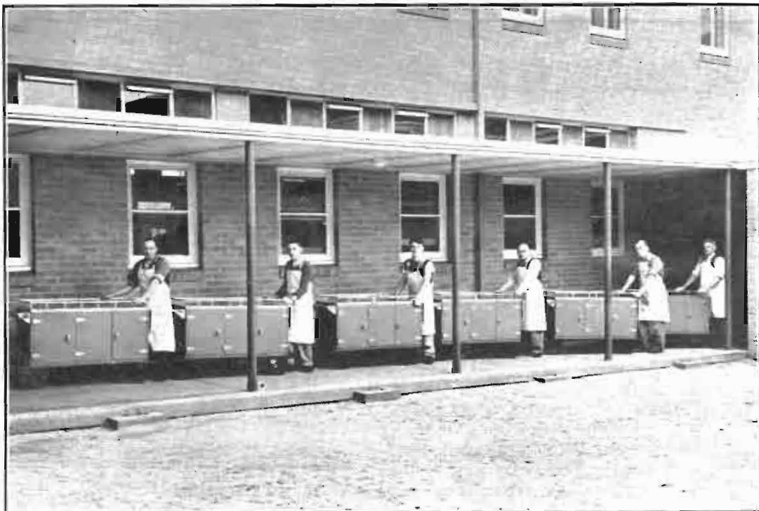
THE SIX ELECTRICALLY-HEATED FOOD TROLLEYS ON THE WAY TO THE LIFTS. EACH TROLLEY CARRIES SUFFICIENT FOOD FOR 60 BED-PATIENTS.