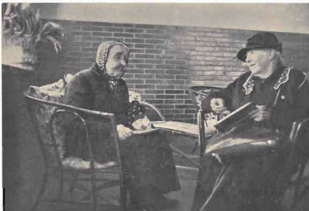
TWO DEAF INMATES CARRYING ON A CONVERSATION WITH THE AID OF SLATES.

N.B.—An Obituary List of Life Governors is filed at the Institution, and the Manager will be obliged if notification is given him of the names of deceased included in the above list.