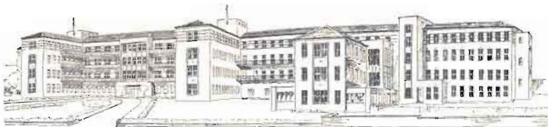
An Artist's Perspective Drawing of the Building as it would appear if these Additions were made.