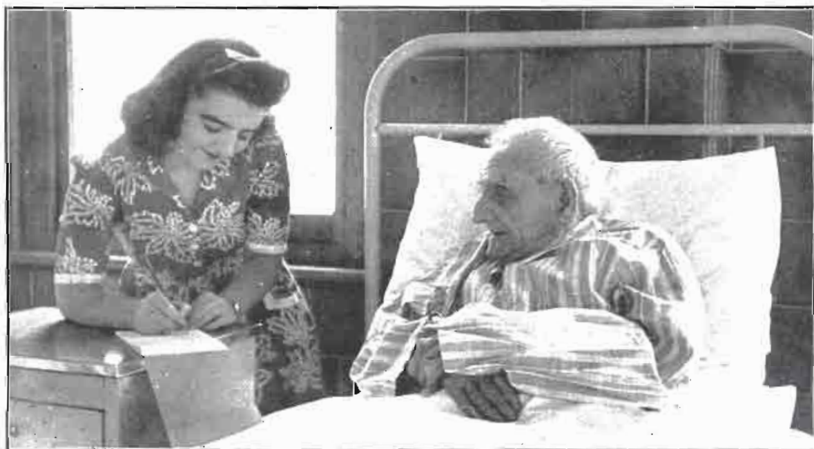
THIS LETTER SERVICE IS GREATLY APPRECIATED BY RELATIVES AND FRIENDS OF OUR BLIND AND INCAPACITATED INMATES,