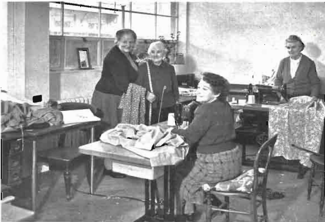
THE DRESSMAKING DEPARTMENT.