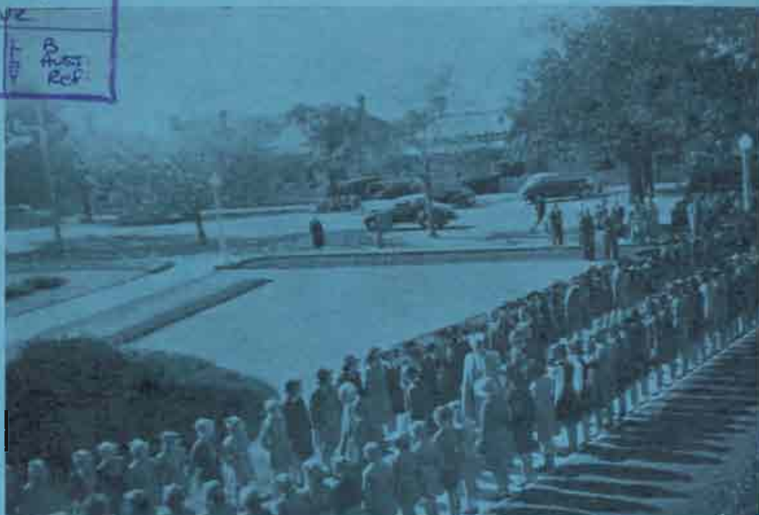
GIRL GUIDES AND BROWNIES FORM GUARD OF HONOUR FOR VISET OF HIS EXCELLENCY THE GOVERNOR OF VICTORIA, SIR WINSTON AND LADY DUGAN.