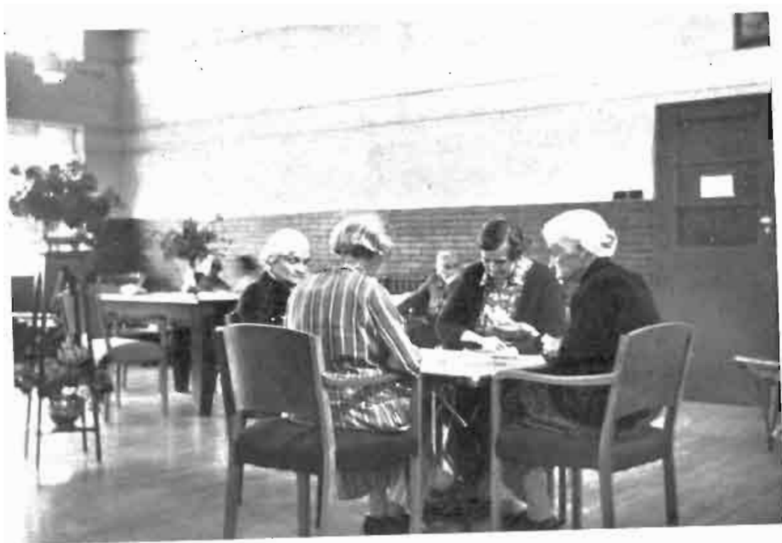
A QUIET GAME OF CARDS.