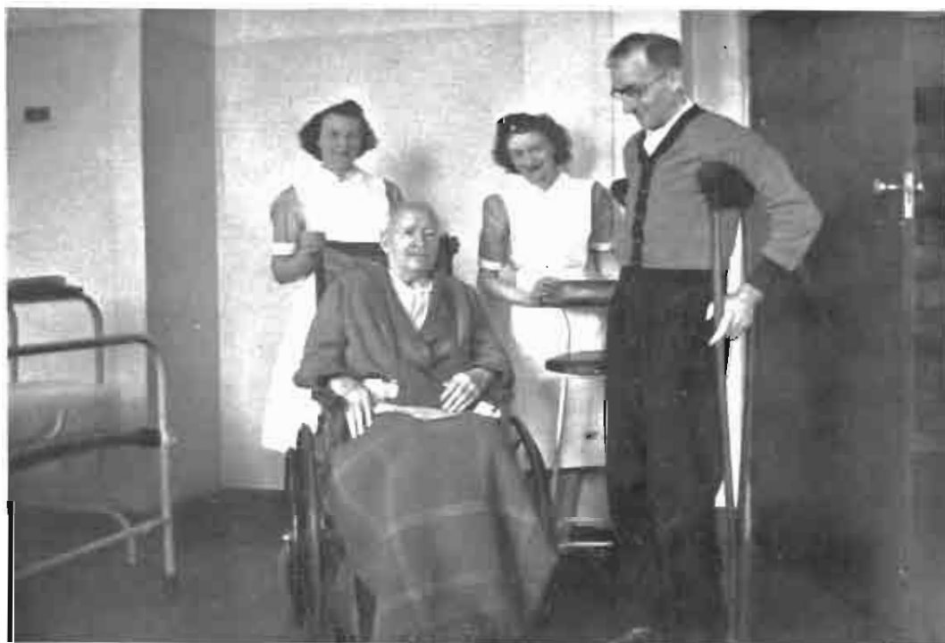
OFF FOR A MORNING PROMENADE.