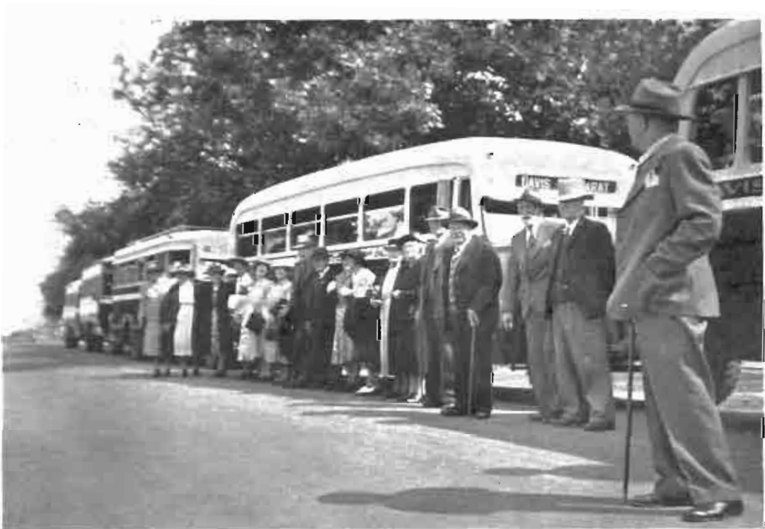
READY TO EMBUS FOR THE PICNIC.