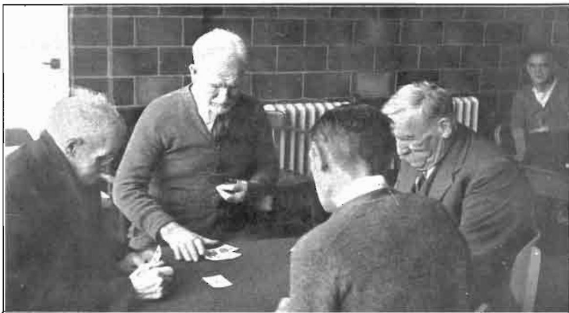
A QUIET GAME OF CARDS IN THE MEN'S SUN ROOM.