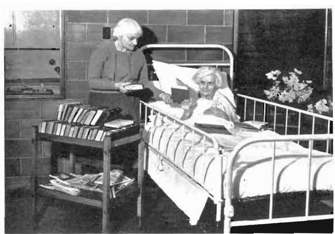
OUR LIBRARIAN HELPING AN INMATE TO CHOOSE A BOOK.