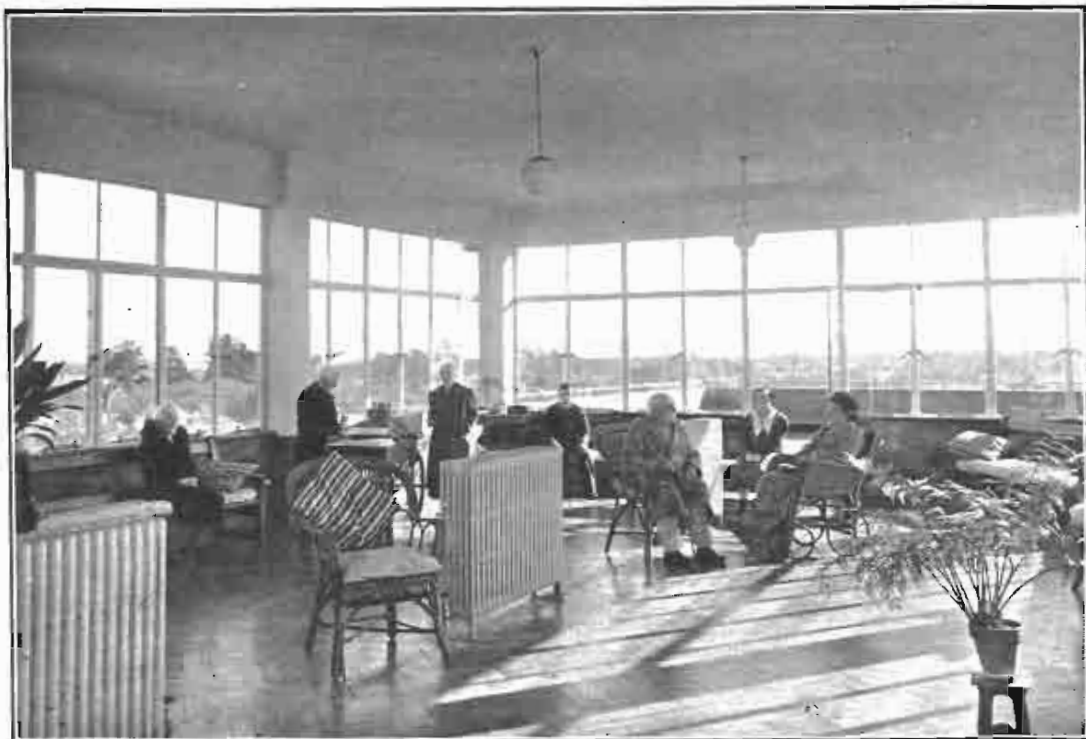
THE SOUTHERN SOLARIUM, WHERE PATIENTS SPEND MANY PLEASANT HOURS. THERE IS ALSO A SOLARIUM OF EQUAL SIZE AT THE NORTHERN END OF THE BUILDING.