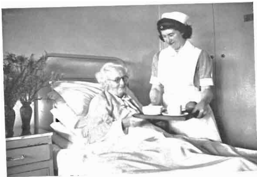
SERVING BREAKFAST TO A BED PATIENT.