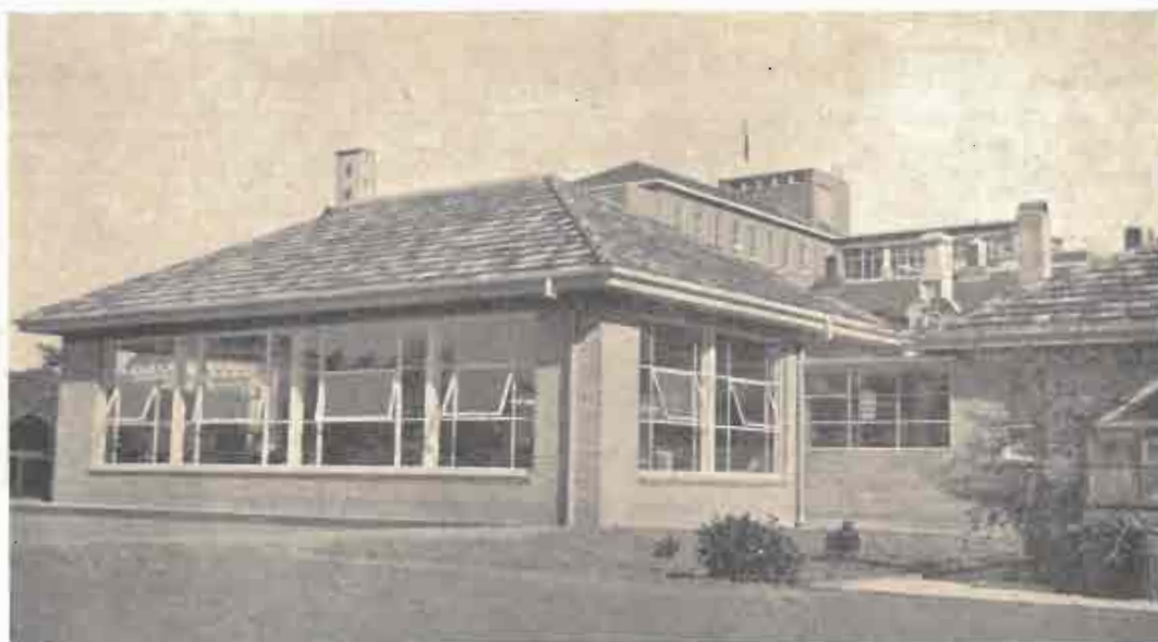
THE NEW SUN ROOM FOR AMBULATORY MEN.