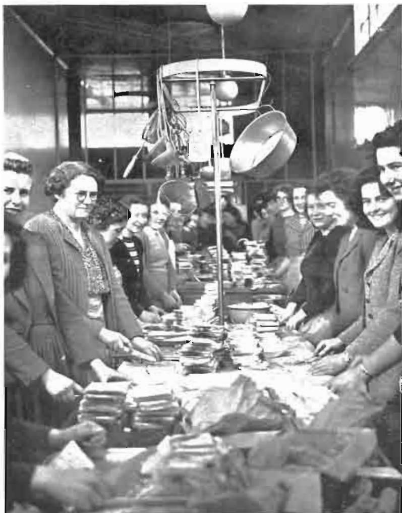
MEMBERS OF PRESBYTERIAN GIRLS' FELLOWSHIP PREPARING THEIR ANNUAL HIGH TEA FOR INMATES.