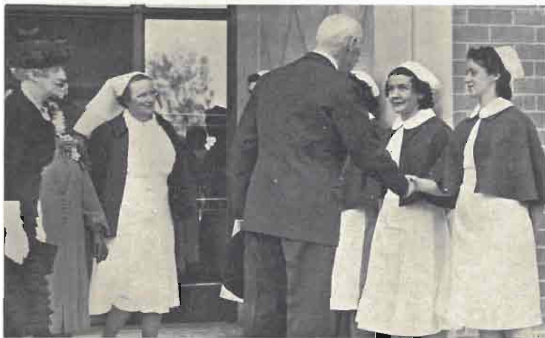
HIS EXCELLENCY GREETING NURSES.