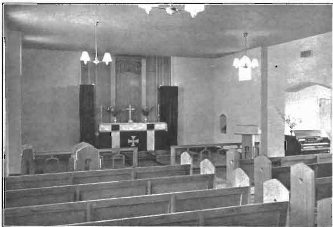
THE CHAPEL WHERE SERVICES FOR EACH DENOMINATION ARE REGULARLY HELD.