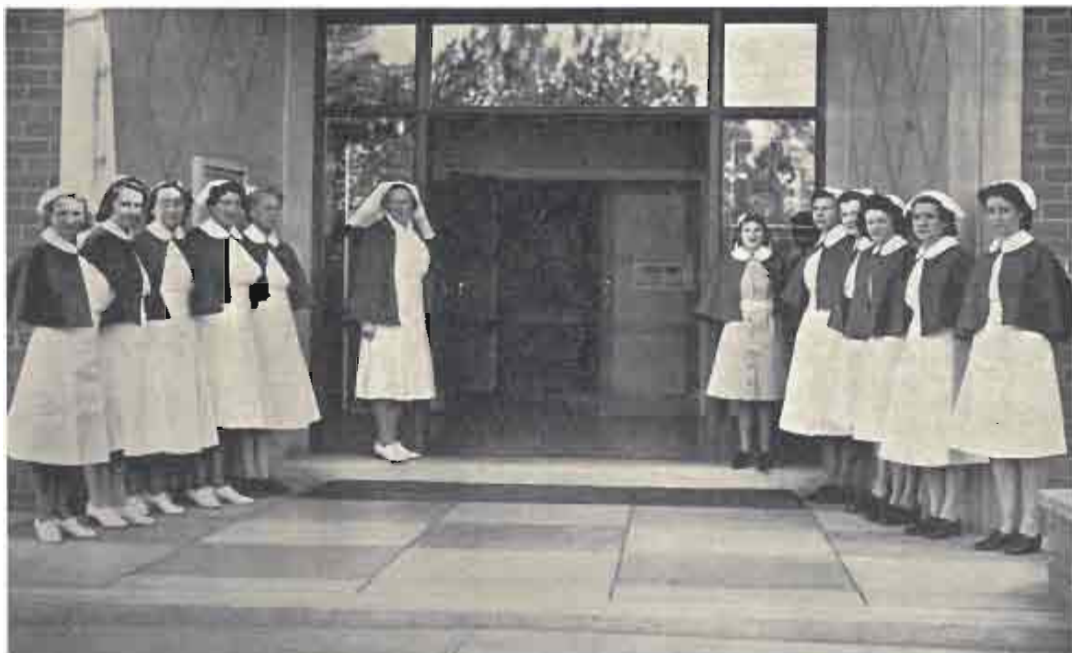
MATRON AND NURSES FORM GUARD OF HONOUR AT VISIT OF HIS EXCELLENCY THE GOVERNOR OF VICTORIA, SIR WINSTON AND LADY DUGAN