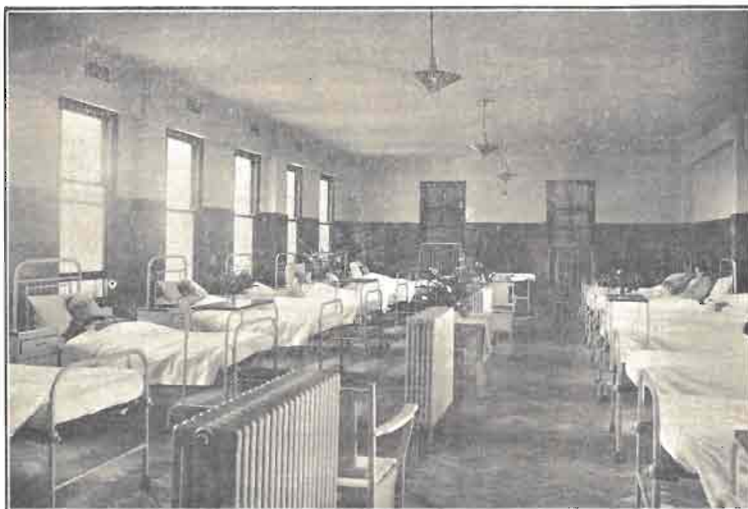
One of the Sixteen 18-bed Wards for Patients.