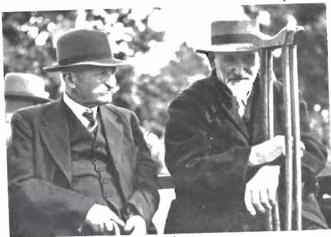
At the Picnic.