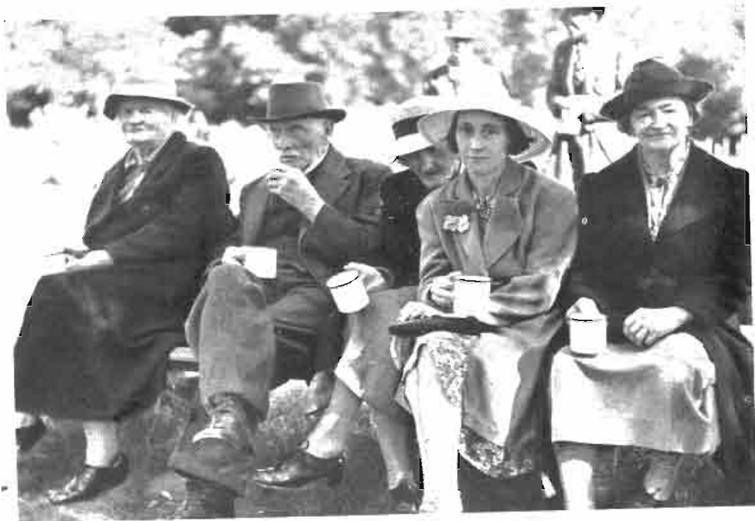
At the Picnic.