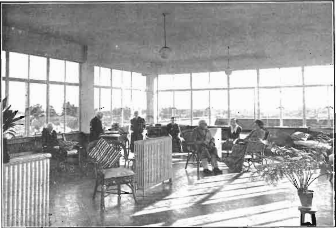
The Southern Solarium, where patients spend many pleasant hours. There is also a Solarium of equal size at the northern end of the building.