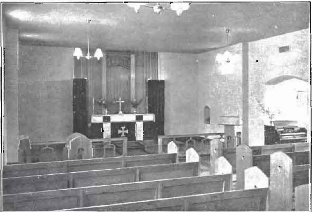
The Chapel where services for each denomination are regularly held.