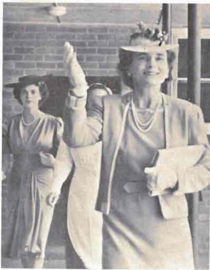
H.R.H. the Duchess of Gloucester acknowledging the cheers of Ambulatory Inmates during her visit to the Home.