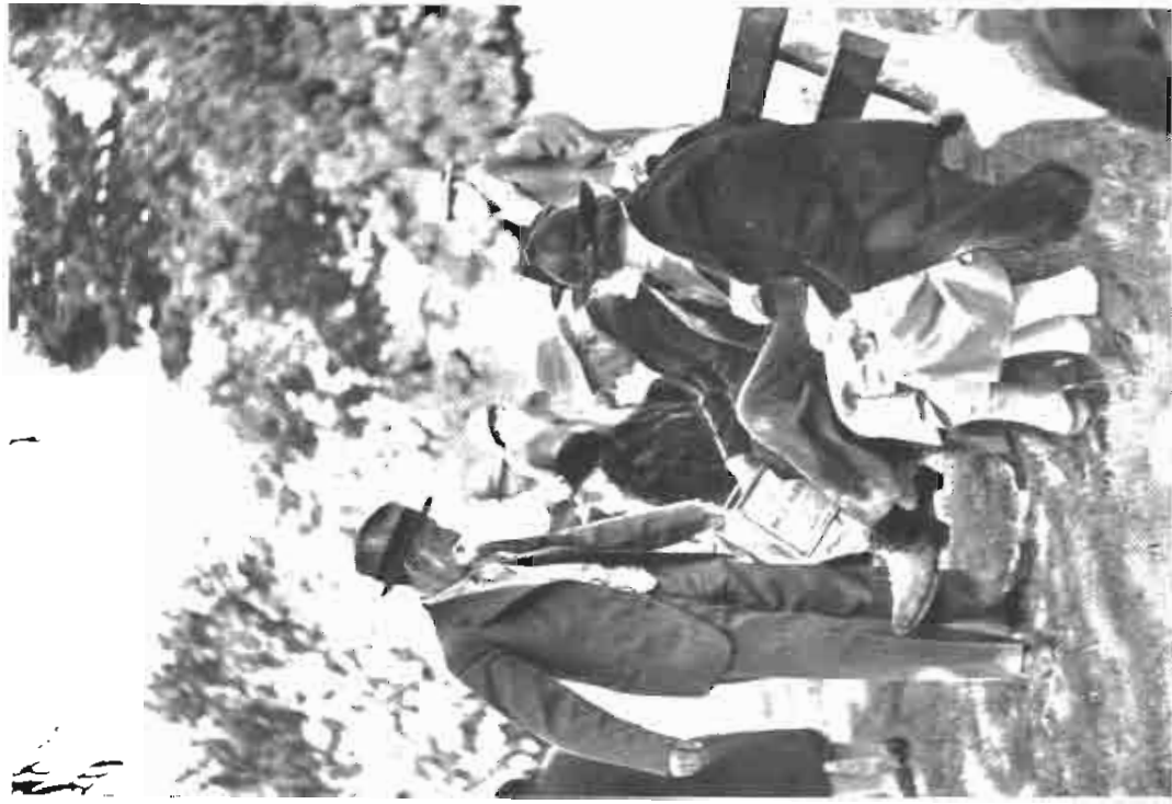
At the Picnic.