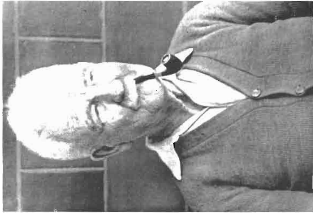
A Fine Type of Inmate.