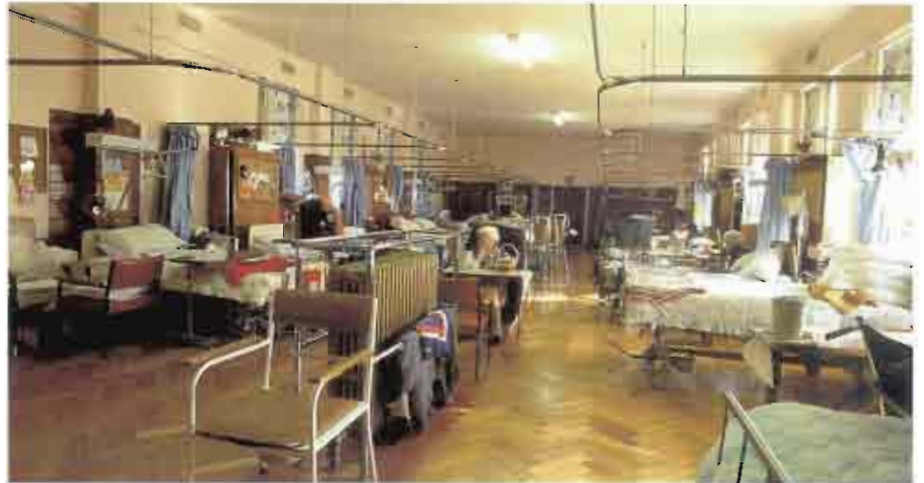
A typical "Nightingale ward" before the conversion.

THE re-opening of the First Floor Unit in November was a landmark in the continued upgrading of facilities at The Queen Elizabeth Geriatric Centre. The six "Nightingale wards", gradually reduced from 90 to 56 beds over the past decade, were transformed into more private single-bed and two-bed units for 46 residents.