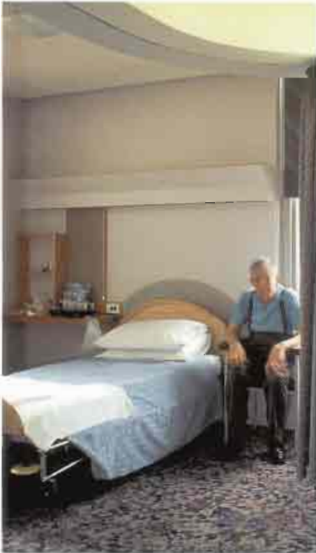
The resident's bedroom offers privacy and comfort in a domestic setting.

THE re-opening of the First Floor Unit in November was a landmark in the continued upgrading of facilities at The Queen Elizabeth Geriatric Centre. The six "Nightingale wards", gradually reduced from 90 to 56 beds over the past decade, were transformed into more private single-bed and two-bed units for 46 residents.