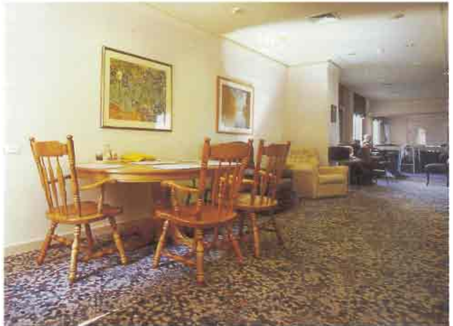
At the residents' request, the dining area has been located close to the Reception — the centre of daily activity.

Emphasis has been placed on “team” work by the staff working in the First Floor Unit and philosophies developed for the care of the residents are leading to altered work practices.