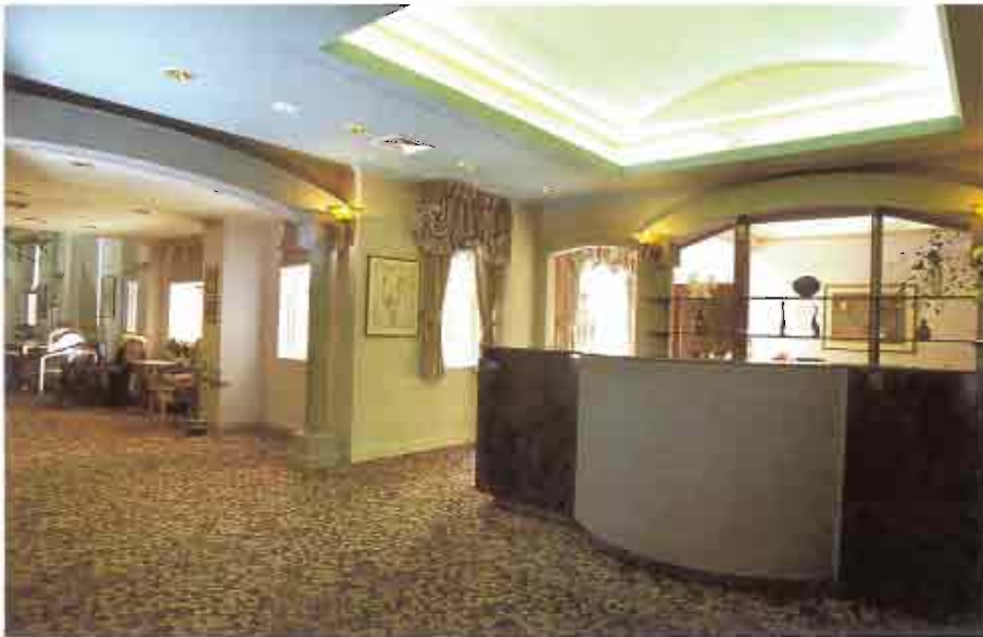
The reception area, located at the lift lobby, is a focal point for the Unit, reflecting the change from institution to unit management.

Emphasis has been placed on “team” work by the staff working in the First Floor Unit and philosophies developed for the care of the residents are leading to altered work practices.