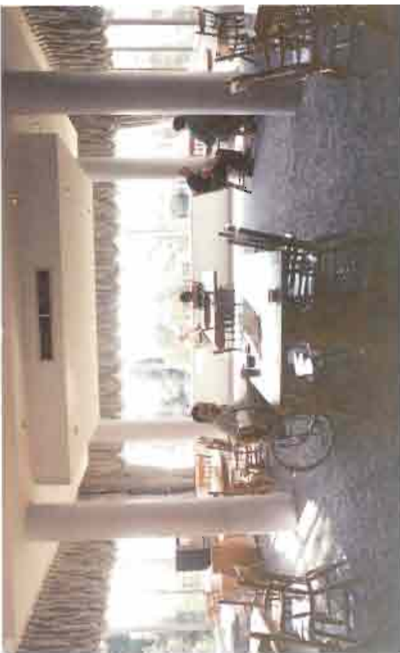
The sunroom of the First Floor is a gathering place for residents to listen to the piano, donated by the Ex-Employees Association, or to watch a video.

Former Minister of Health, Hon. Caroline Hogg, was so delighted with the results of this project she was moved to make special comment in the Legislative Assembly.