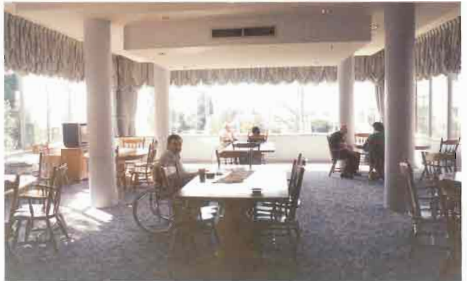
The sunroom of the First Floor is a gathering place for residents to listen to the piano, donated by the Ex-Employees Association, or to watch a video.

Former Minister of Health, Hon. Caroline Hogg, was so delighted with the results of this project she was moved to make special comment in the Legislative Assembly.