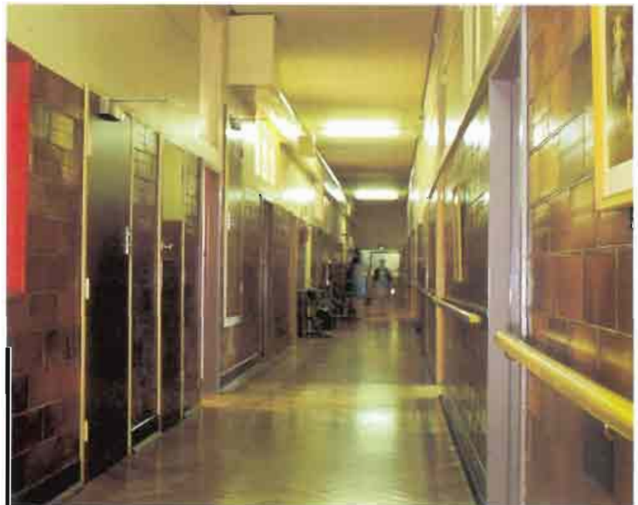
Long, impersonal corridors have given way to light, relaxing living areas.

A large number of people co-operated and collaborated in designing the refurbishment to ensure that both residents' and staff needs have been more than adequately met.