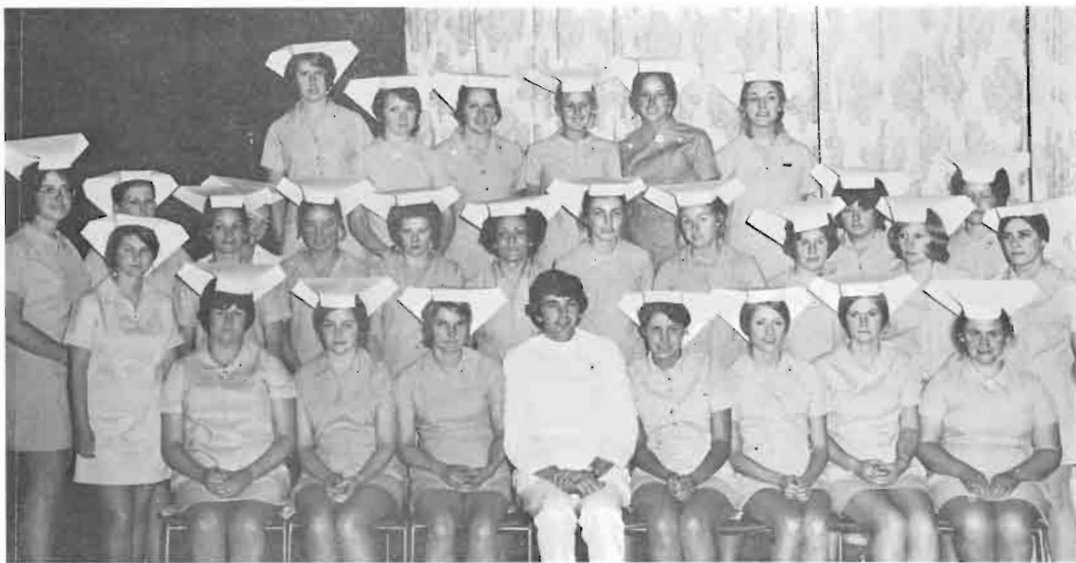
Graduates of the Ballarat Base Hospital who received their certificates at the 1972 graduation ceremony.