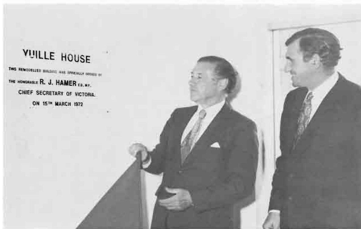
Hon. R. J. Hamer unveiling Yuille House opening plaque.