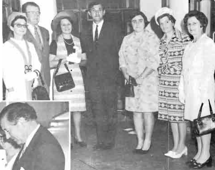
Above: Official group at Trained Nurses' League reunion.