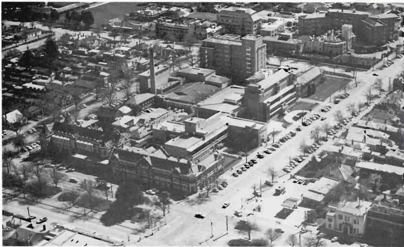
AERIAL VIEW OF BALLARAT AND DISTRICT BASE HOSPITAL